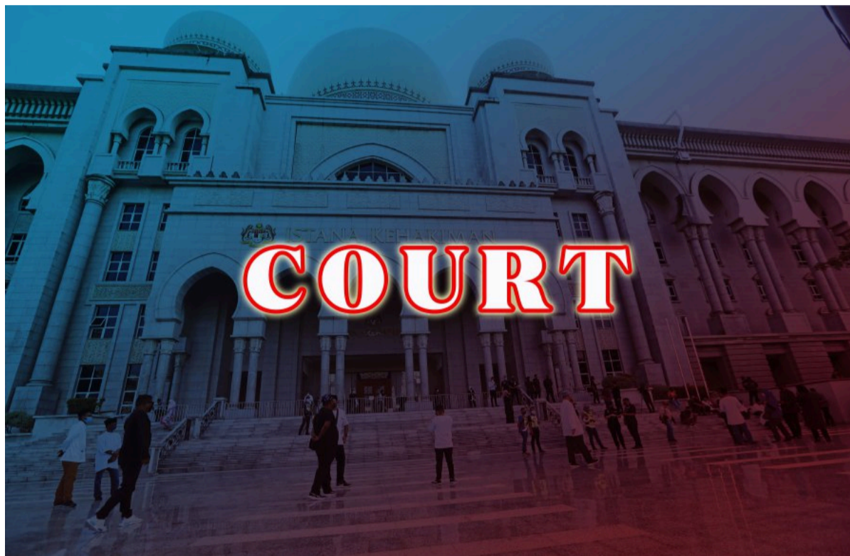
-NSTP file piic, for illustration purpose only.

PUTRAJAYA: The Court of Appeal has fixed Aug 15 to hear an appeal by the Malaysian Anti-Corruption Commission (MACC) against a Temerloh High Court decision that set aside a remand order issued on six policemen.